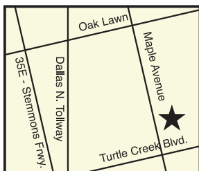
Heritage World Headquarters

THIS AUCTION IS PRESENTED AND CATALOGED BY CURRENCY AUCTIONS OF AMERICA, INC.